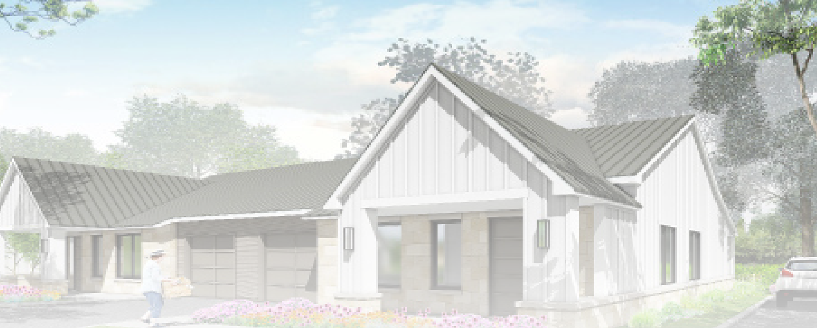
Conceptual Design of New Independent Living Villas on the Lake