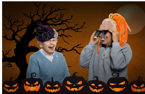
Fox Manor residents get into the Halloween spirit.